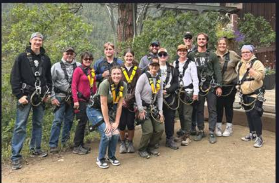
Soaring Adventure September 2023

Presence Humility Curiosity Generosity Commitment Authenticity