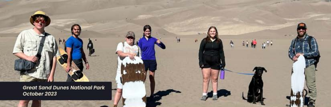
Great Sand Dunes National Park October 2023